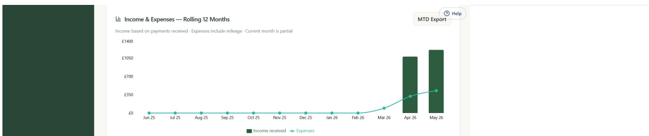
Rolling 12-month income and expenses – income received vs expenses including mileage

Track business income and expenses with HMRC-ready categorisation, mileage logging, grants tracking, and a rolling 12-month income and expenses chart.